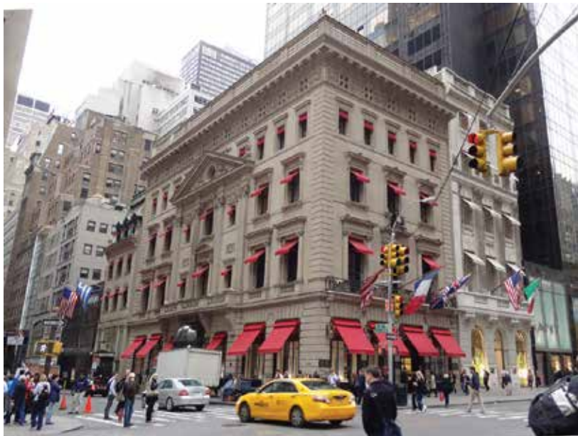
Cartier's flagship store, located at 653 5th Ave. in New York, was retrofitted in 2001 as part of a renovation.

Is the door into a bedroom of an old home simply a bedroom door? I had a customer who wanted a recommendation on making hardware more secure for a vintage Victorian that was being converted to a bed and breakfast. I advised him